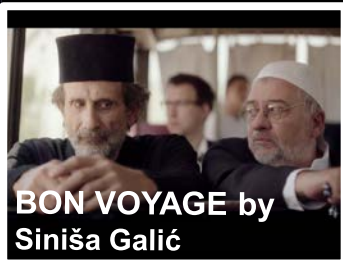
BON VOYAGE by Siniša Galić