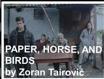
PAPER, HORSE, AND BIRDS by Zoran Tairović