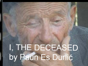
I, THE DECEASED by Paun Es Durić