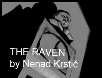
THE RAVEN by Nenad Krstić