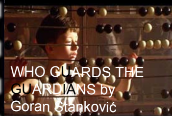
WHO GUARDS THE GUARDIANS by Goran Stanković

6 PM, Sunday, April 20, 2008 & 8 PM, Wednesday, April 23, 2008