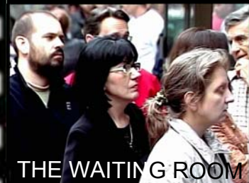
THE WAITING ROOM by Luka Uzelac