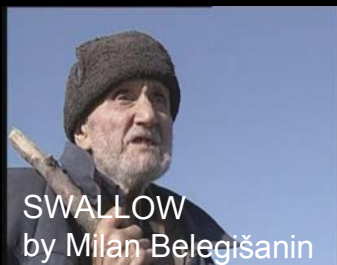
SWALLOW by Milan Belegišanin