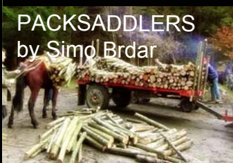
PACKSADDLERS by Simo Brdar