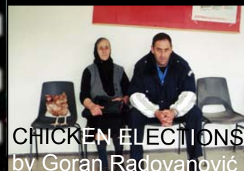
CHICKEN ELECTIONS by Goran Radovanović