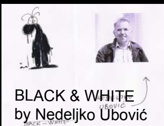
BLACK & WHITE by Nedeljko Ubović